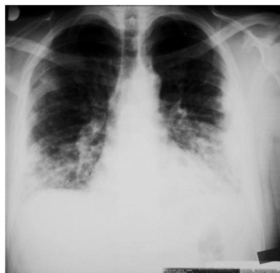
Fig. 3. Chest radiograph shows bilateral pneumonia like patchy consolidations.

eral pneumonia. Fiber optic bronchoscopy demonstrated only yellow secretion in tracheobronchal system. Microbiological, mycological and cytological findings of the specimens obtained by bronchial washing were negative. Mycobacteria Growth Indicator Tube test was negative. All the hemocultures were negative too, the serological tests on respiratory viruses and HIV as well. The radiography of the right shoulder showed no local abnormalities after surgery. On the initial combined antimicrobial therapy the patient did not react. He remained high febrile and developed small pleural effusion. The pleural puncture was performed. The cytological finding pointed to the inflammation. Microbiological finding was negative. Control chest radiography showed bilateral pneumonia-like infiltrates (Figure 3) and CT showed progression of the disease and few nodular infiltrates were observed pointing to possible metastasis process (Figure 4). CT guided transthoracal puncture was performed – cytological finding was typical for inflammation. Despite changed antimicrobial therapy clinical worsening occurred and the patient died two weeks later. The autopsy showed multiple metastases of the lung with multiple small thromboemboli of the lung by tumor cells.