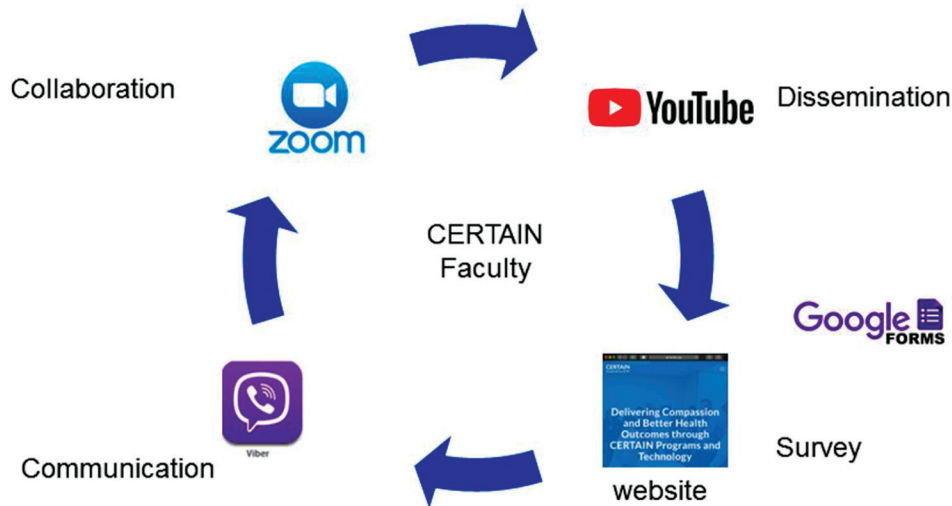
FIGURE 1. Schematic representation of the multimodal knowledge-sharing platform.

Between April 6 th and May 12 th , 2020, 1,990 educational messages were exchanged on Viber, followed by 12,443 likes and 297,226 views. Participants were from 25 countries, with the highest engagement of clinicians from Serbia, Bosnia and Herzegovina, United States, Croatia, North Macedonia, and Montenegro.